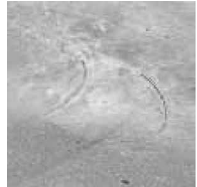
Fig. 2: Trowel marks

Trowel marks: Concrete surface features (Fig. 2)—produced by troweling—that can be seen and felt (have a vertical profile).