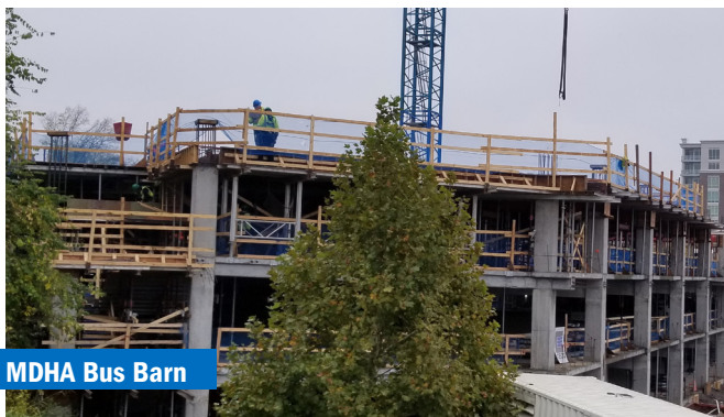
MDHA Bus Barn